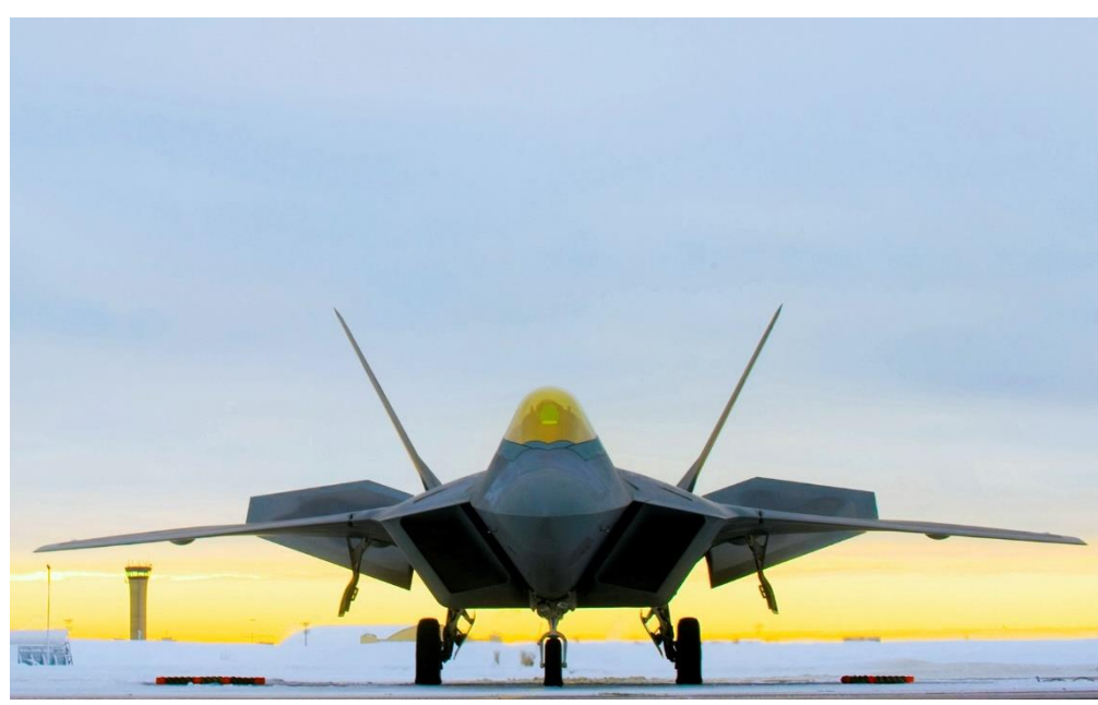
Crown copyright 2018 You may re-use this information (not including logos) free of charge in any format or medium, under the terms of the Open Government Licence. Visit <a href="https://www.nationalarchives.gov.uk/doc/open-government-licence">www.nationalarchives.gov.uk/doc/open-government-licence</a>