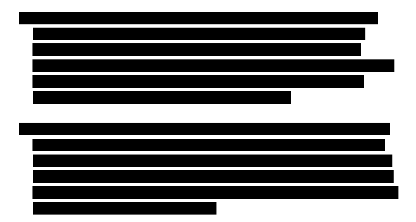
ACTION 1: The Funding Team to follow up on the Committee's decisions and obtain additional quotes/more information against the relevant indicative funding bands (see Annex A below).